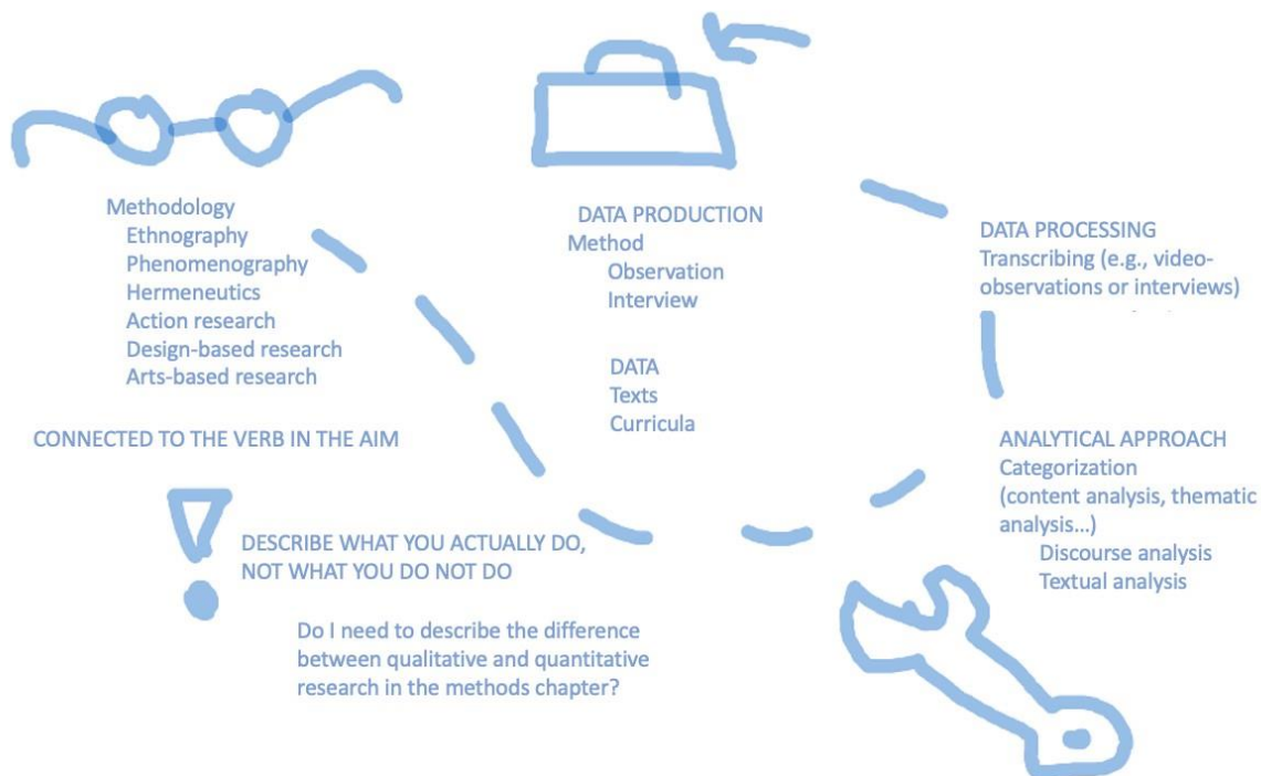
Figure 3. The tutor created in-the-moment drawings related to the students' questions on the interactive Zoom whiteboard.

New digital communication patterns emerged in Zoom when students wrote private chat messages to the tutor. Private chats in Zoom created new ways for the tutor to share anonymous questions with the whole group. Private chats in Zoom helped create sensitive communication patterns to discuss relevant matters. However, private chats pointed to new ethical considerations because the tutor had to determine what messages were intended for private discussions with her and what information she could share with the group.