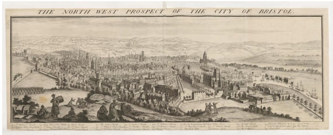
Figure 2. Samuel and Nathaniel Buck. “The North West Prospect of the City of Bristol” (1734a).