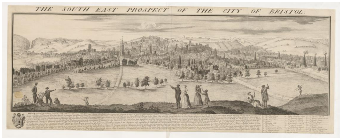
Figure 3. Samuel and Nathaniel Buck. “The South East Prospect of the City of Bristol” (1734b).

century building. Colston’s Alms House stemmed from 1691 and the Royal Fort from the Civil War. The city’s Tolzey had been there since the middle of the sixteenth century, while both the Guildhall and the High Cross were from the middle of the fourteenth century. 6 Finally, the ornate stone bridge which crossed the Avon had been built in the thirteenth century. It has not been possible to date with certainty all the buildings mentioned by Goldwin, but it is safe to assume that they all fall within these temporal perimeters.