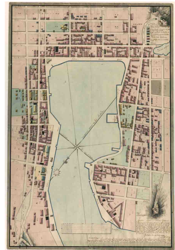
Fig 1. The last decade of the eighteenth century was characterized by an increasing number of immigrants to St. Barthélemy, the majority of which were concentrated to the port town of Gustavia, depicted in these three maps. They were drawn up – from left to right – in 1792, 1796 and 1799 respectively, by the council secretary and government physician Samuel Fahlberg. They give a lively impression of the urban development during that time. The buildings of the Swedish administration and SWIC can be seen marked in dark yellow in the 1799 map. Swedish Military Archives (Krigsarkivet).