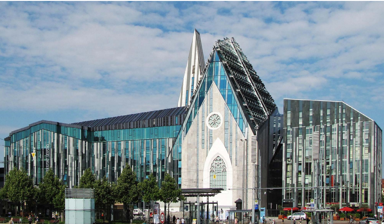
The Paulinum – Assembly Hall and University Church of St. Paul and the New Augusteum.

Concord, 2012 (Wikimedia Commons, CC BY SA 3.0)