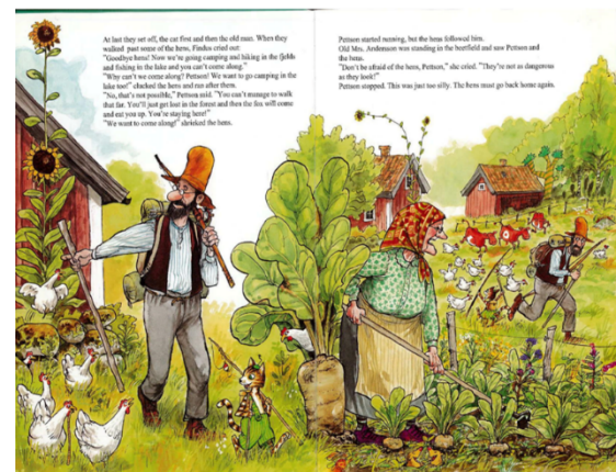
Figure 4: Nordqvist, 1992, p.3.

I argue that the playful back and forth of realism and fantastical elements in Nordqvist’s illustrations show the interesting relationships within the natural world of the seen and the unseen. Pettson’s household is pictured for us readers as a porous household. It is clear to us that the “muckles”, the chickens and the objects in the pictures help make Pettson’s home. Often the real and the fantastical leak into each other. For example, in Pettson goes camping (1992), there is a parsnip rendered in loving detail on the page break, it is however also the size of a tree, and serves as a hiding place for one of the chickens.