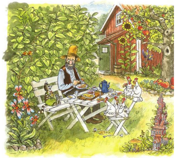
Figure 2: Nordqvist, 2007, p. 22.