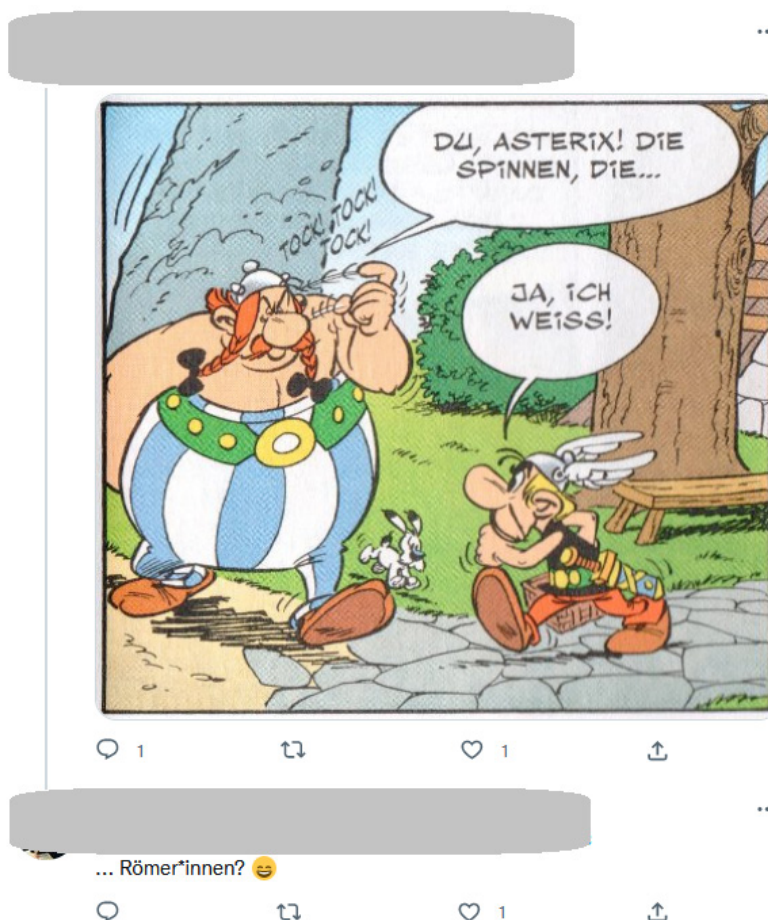
Figure 1: Humorous tweets from opponents and proponents of gender-fair language.

An opponent of gender-fair language made the implicit suggestion that proponents of gender-fair language are crazy (see section 4.3.1. below for more excessive versions of this pattern) using a panel from the comic Asterix. A proponent reacted just as humorously by suggesting the insertion of a gender-fair form into the quote.