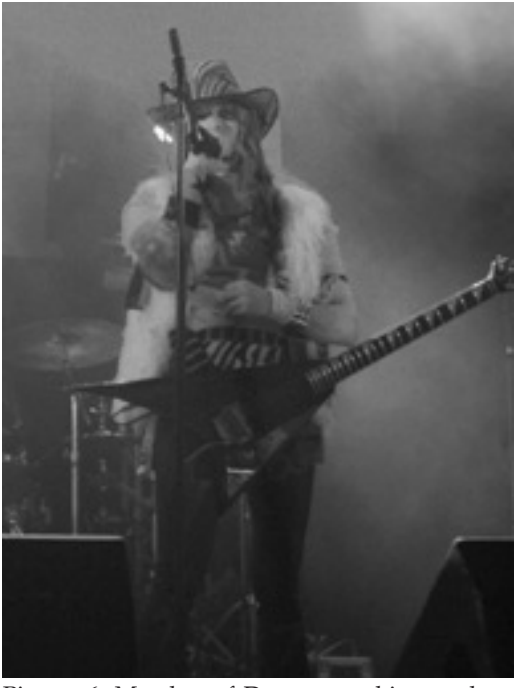
Picture 6. Member of Desyre speaking to the crowd at Immortal Metal Fest in 2008.