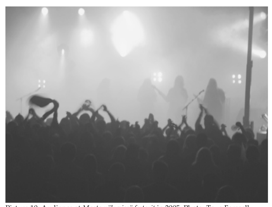
Picture 10. Audience at Maata näkyvissä festarit in 2005.