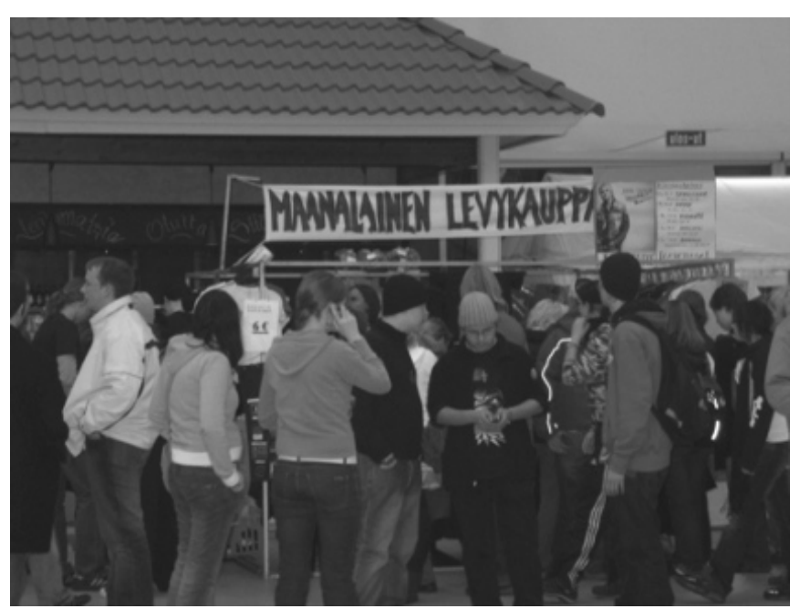
Picture 9. Stand of Maanalainen levykauppa/The Underground Recordstore at Maata Näkyvissä festarit in 2005.