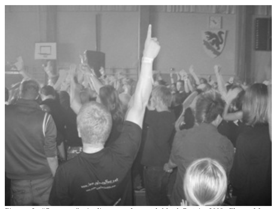
Picture 2. "One way". Audience at Immortal Metal Fest in 2008.