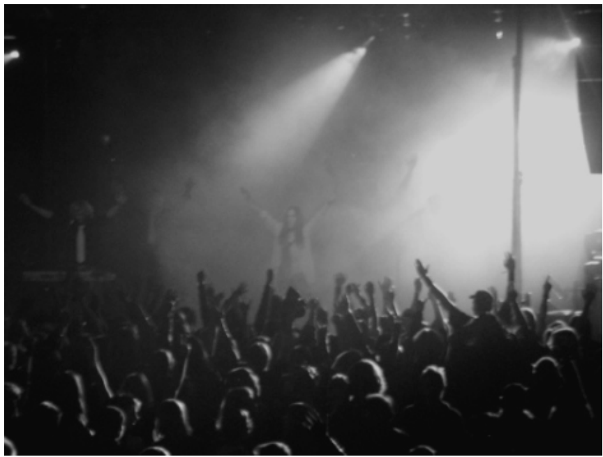
Picture 3. "Praise pose". Recidivus live at Maata näkyvissä festarit in 2005.