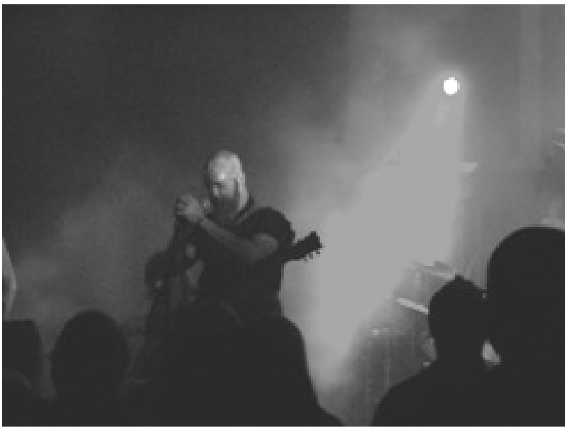
Picture 7. Frontman of From Ashes saying a prayer as part of a song during a live performance at Immortal Metal Fest in 2008.