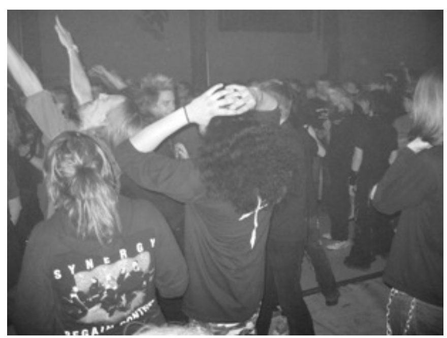
Picture 4. "Praise pose". Audience at Immortal Metal Fest in 2007.