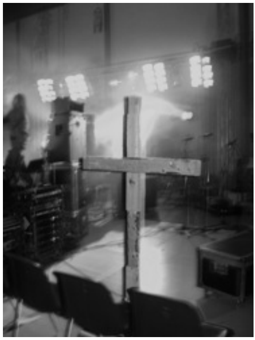
Picture 8. Wooden cross beside the stage at Immortal Metal Fest in 2007. The festival featured a Metal Mass .