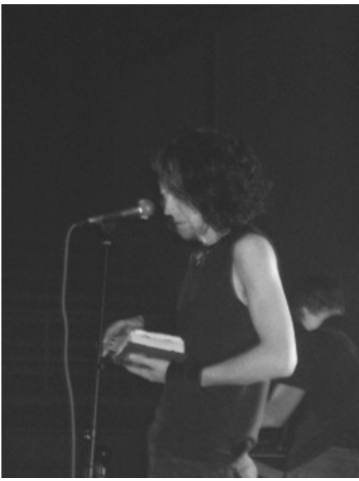
Picture 5. Member of Sacrecy reading from the Bible during a live performance at Immortal Metal Fest in 2007.