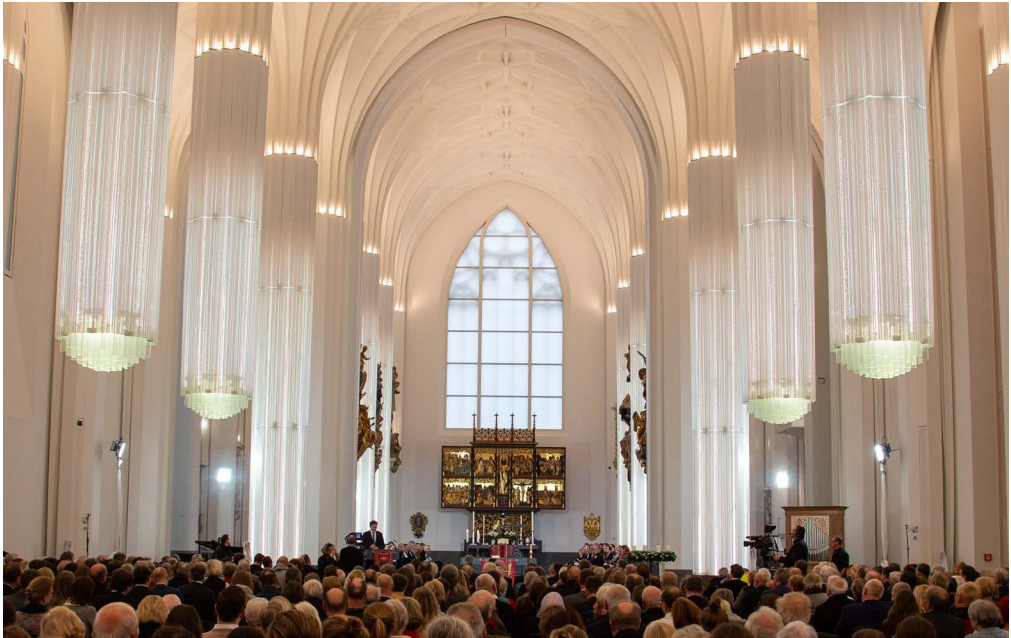
Inauguration of the new university church in Leipzig 3 December 2017.