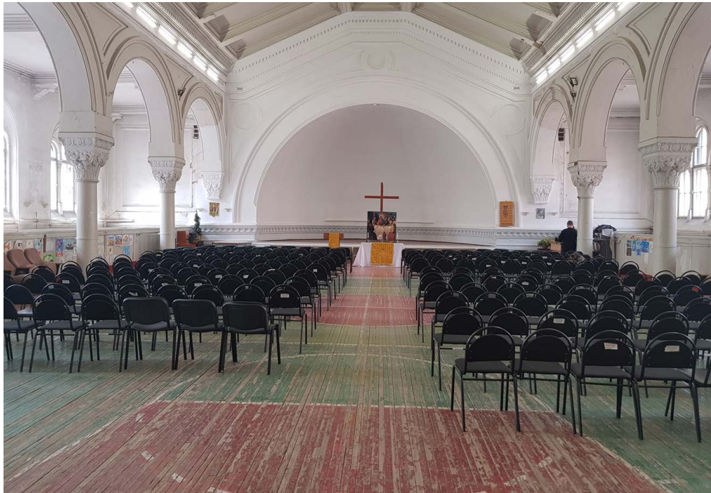
The church hall with the disputed floor, 2019.

cultural institute. 35 He also acknowledged the potential concerns of the appropriateness of placing a secular institute in a church but downplayed this issue by noting the growing trend of desacralization of churches in Sweden and the common use of churches for various purposes in Russia.