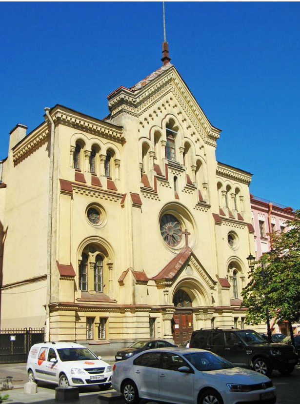
The Church facade.